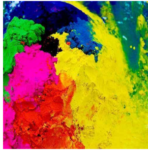
Holi Festival Pigments